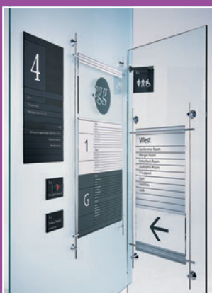
HB Modular Sign System