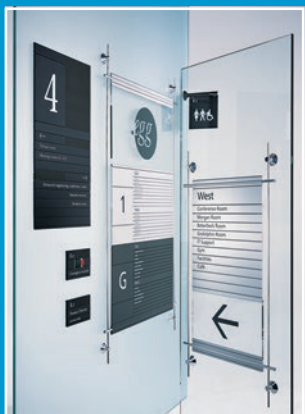
HB Modular Sign System