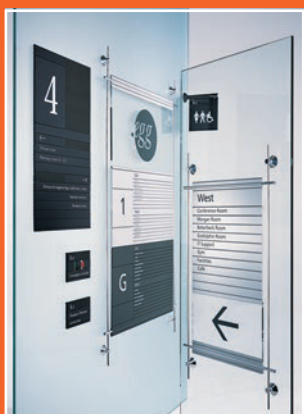
HB Modular Sign System